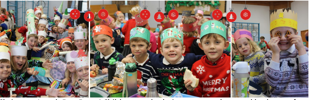
Christmas Lunch Box Party! Children made their own party hats and had great fun in a big festive party in the hall on Tuesday. Thanks to all the parents for supplying the party food!