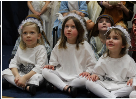
Well done to Class R for two fantastic Nativity performances!