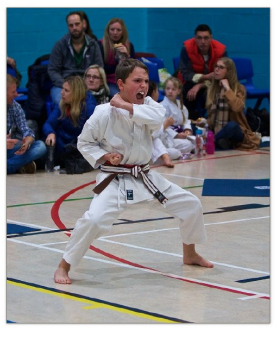
THE MILVERTON VICTORIA ROOMS Tuesdays: 18:00 - 19:00 Beginners 19:00 - 20:00 Advanced

Traditional Shotokan Karate classes for all ages 6+