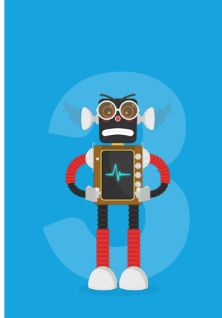
Don't Hold on to What's Wrong!