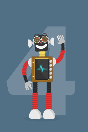
Fake Is A Mistake!