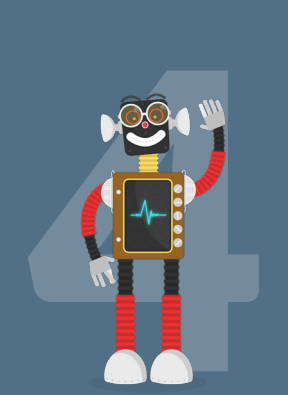
Fake Is A Mistake!