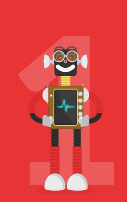
Don't Forget To Let Love In!