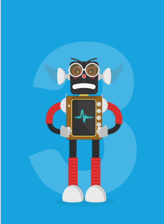
Don't Hold on to What's Wrong!