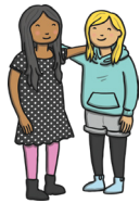
Personal Social Emotional Development