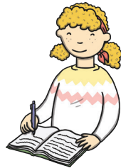
Phonics and Literacy