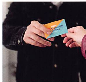
Your membership card