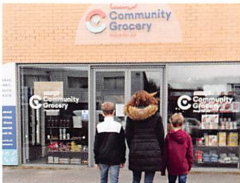
The first Community Grocery

We know choosing the items you like for your family is really important and so we have thousands of products to select from each week with new lines added each day.