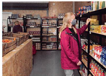
Inside a Community Grocery