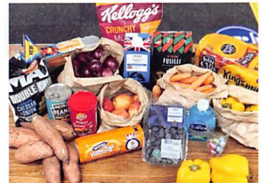
Example of a £4 shop

Our members not only get to save on their food shop but they also get to play their part in helping to protect the environment. Lots of the items in our grocery have been given to us by local supermarkets and would have normally ended up going into landfill. The food is all great, and there are many reasons why supermarkets have surplus food to donate. It may be there are packaging mistakes, errors with ordering or that the food that ends up too close to its 'best before' date for them to sell. So they've given it to the Community Grocery.