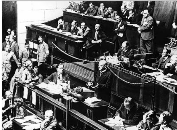
[Gustav Stresemann addressing the League of Nations, September 1926]

Use Source A and your own knowledge to describe the work of Gustav Stresemann during the period 1924-29.