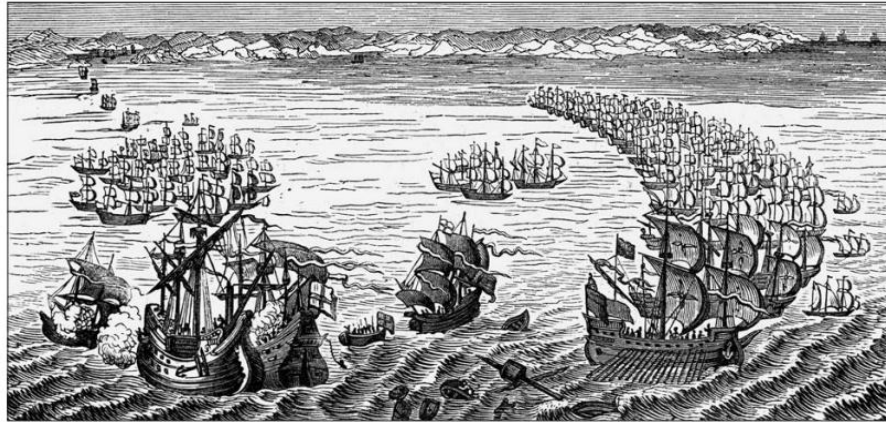
[A contemporary drawing of the English fleet attacking the Spanish Armada, 1588]