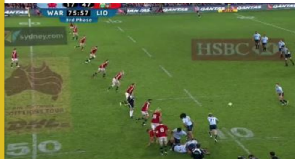
Defensive Line is shown in the picture above in the red team