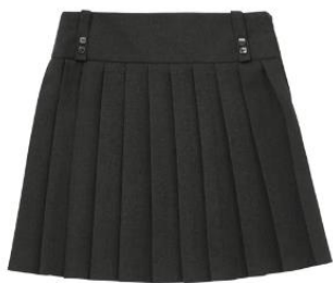
2 Pack Of Permanent Pleat Kilt Skirts - Grey £9.33