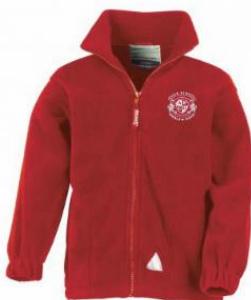
Result Fleece - Red £13.50