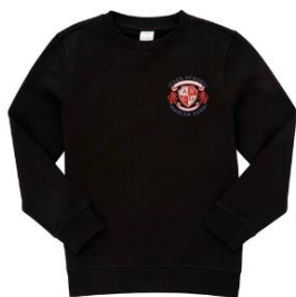
Sweatshirt - Black £10.30