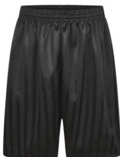
Shadow Stripe Shorts Black £5.50