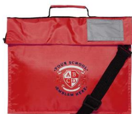
Book Bag - Red £5.99