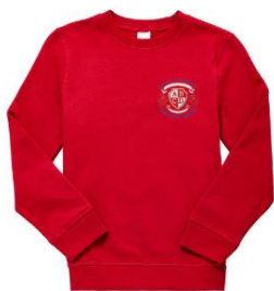
Sweatshirt - Red £10.30

Please Note: Logos shown on items are for positional purposes only. Moorfield Primary School specific logos will be supplied on ordered items.