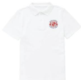
Polo Shirt - White £6.80