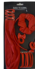
Large School Hair Set Red £5.99