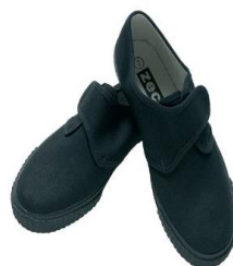
Plimsolls With Velcro £5.50