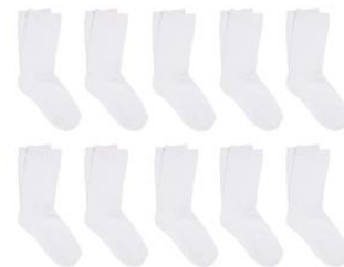
10 Pack Of Ankle Socks - White £12.00