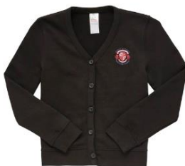
Jersey Cardigan - Black £10.30