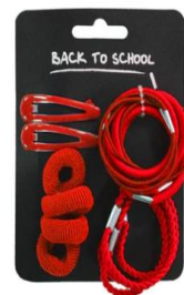
Small School Hair Set Red £5.00