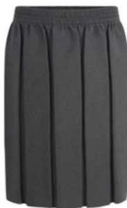
Box Pleat Skirt - Grey £9.50