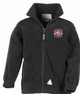
Result Fleece - Black £13.50