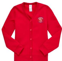
Jersey Cardigan - Red £10.30