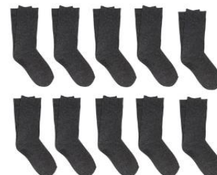
10 Pair Pack Of Ankle Socks - Grey £12.00