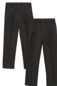
2 Pack Of Boys Teflon EcoElite™ Pleat Front Regular Fit Trousers - Dark Grey £10.99