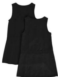
2 Pack Teflon EcoElite™ Permanent Pleat Pinafore - Grey £10.99