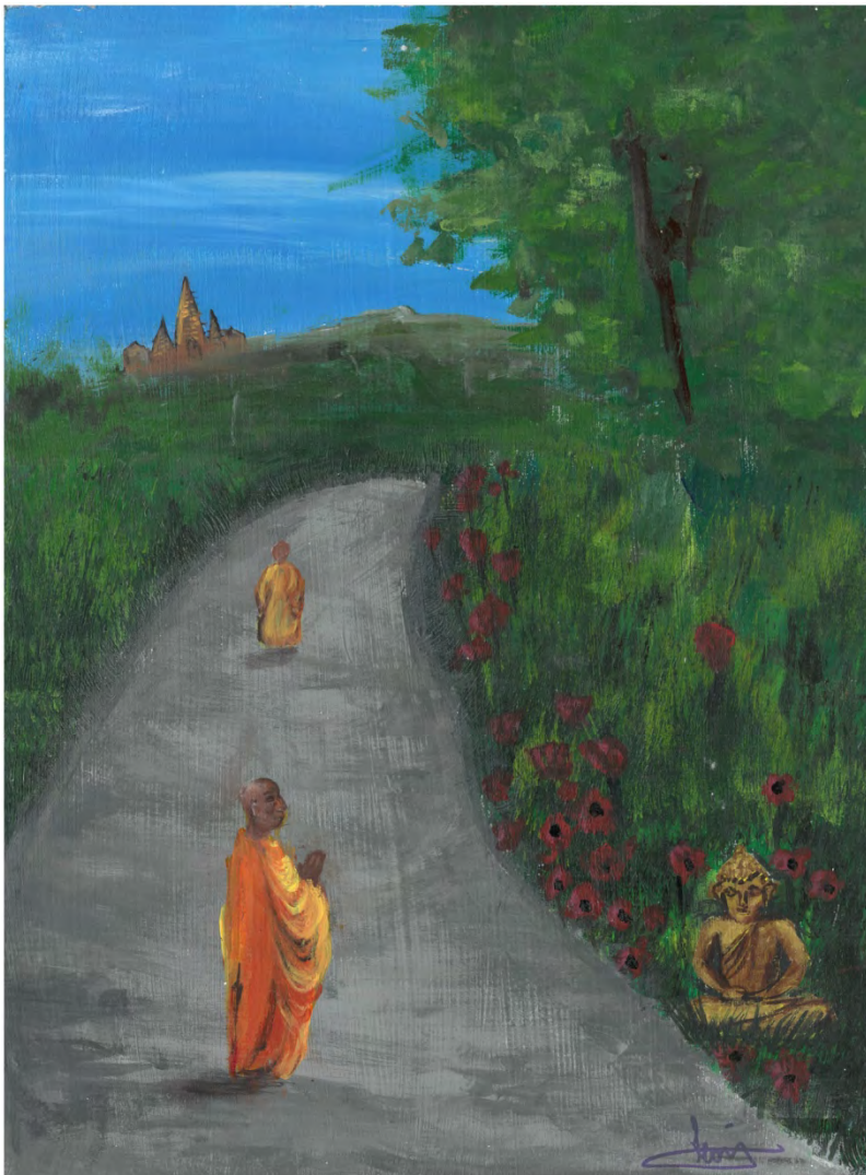
Leonie, aged 13