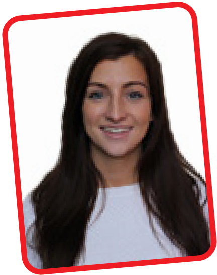
Miss Gatton 2G