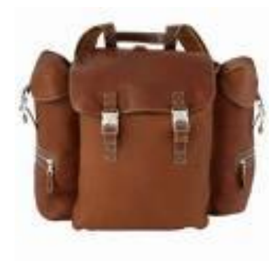
In the Giant's Rucksack