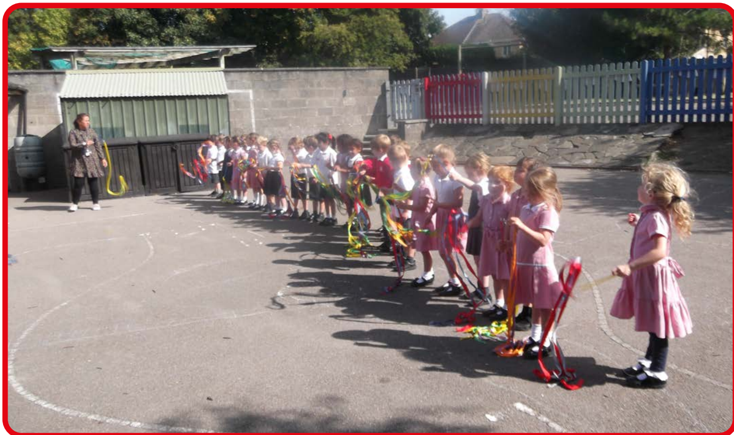
1R having fun in P.E. ...