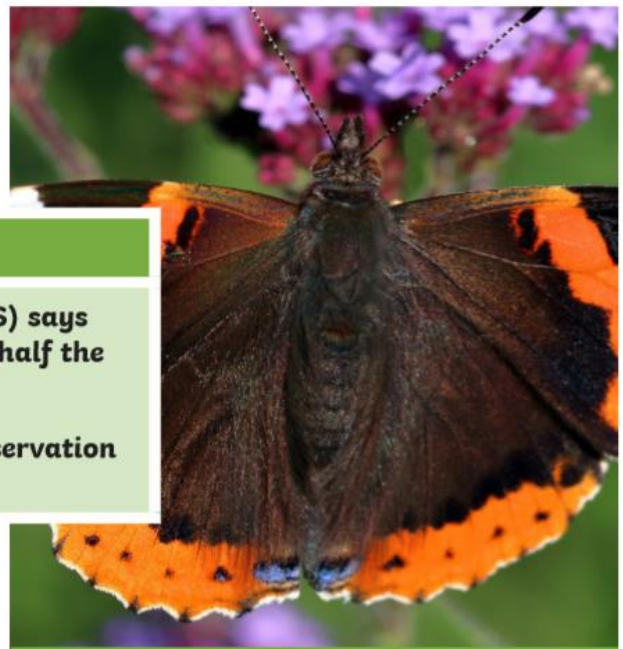
Photo: The red admiral butterfly.

Last year, over 2500 volunteers went to over