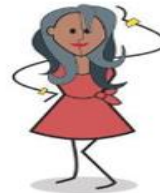
HERMIA Loves Lysander