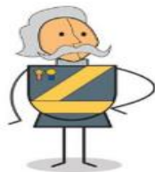
EGEUS Father of Hermia