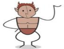
PUCK Mischievous fairy