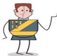
THESEUS Duke of Athens