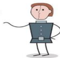
DEMETRIUS Suitor of Hermia