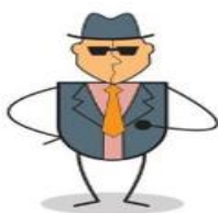
NICK BOTTOM A weaver