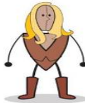
OBERON King of the Fairies