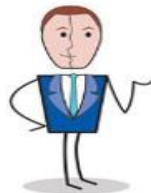
LYSANDER Loves Hermia