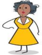
HELENA Loves Demetrius