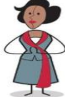
HIPPOLYTA Amazon Queen