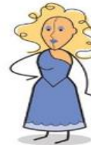
TITANIA Queen of the Fairies