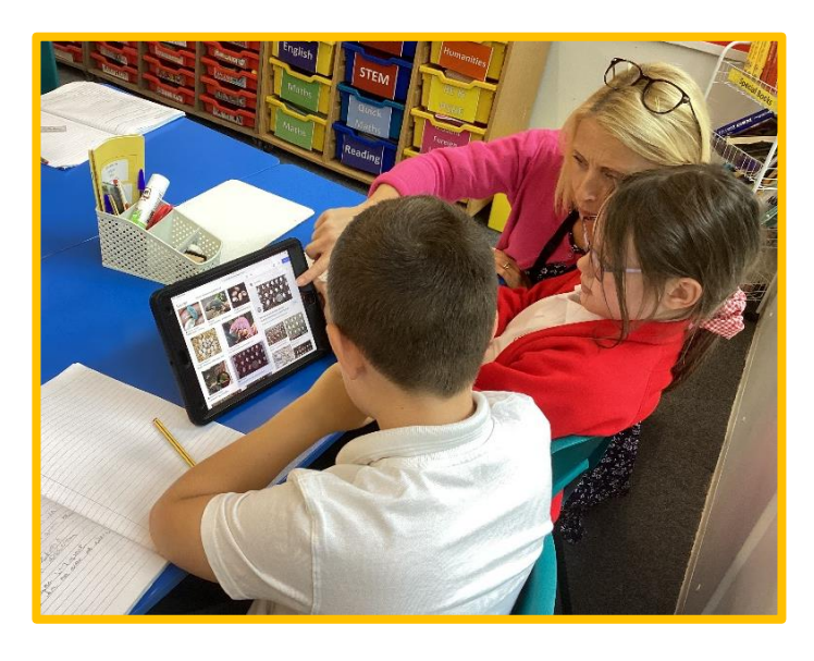
Year 4 have been using the iPads to support their learning this week.