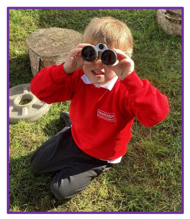
For their first Feel Good Friday, EYFS played some playground games and explored the playgrounds some more.