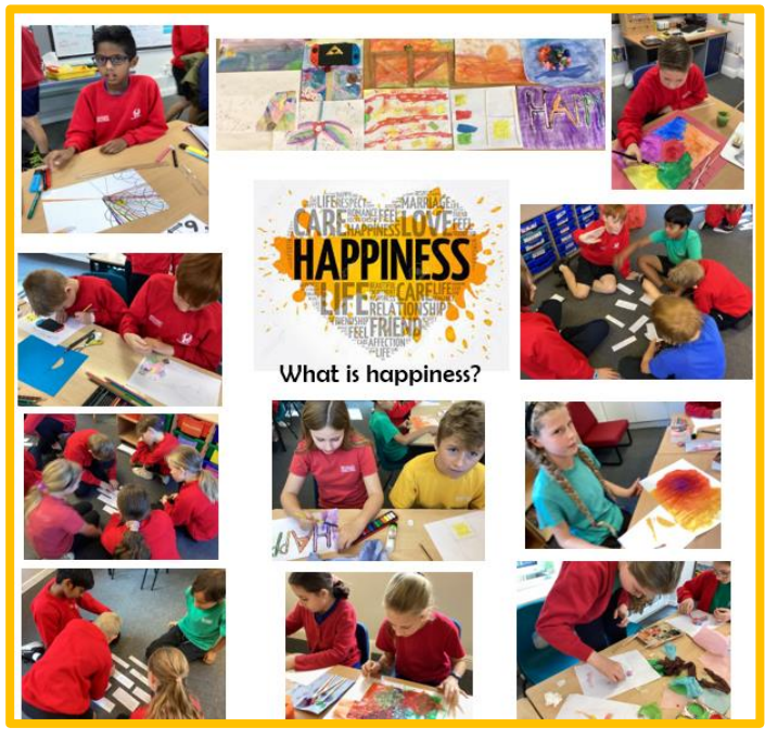
Year 6 explored what happiness means to them. They investigated different ways we can enhance happiness in our lives; discussed and prioritised these different ideas into a 'Diamond 9'. They expressed what happiness means through the medium of art.