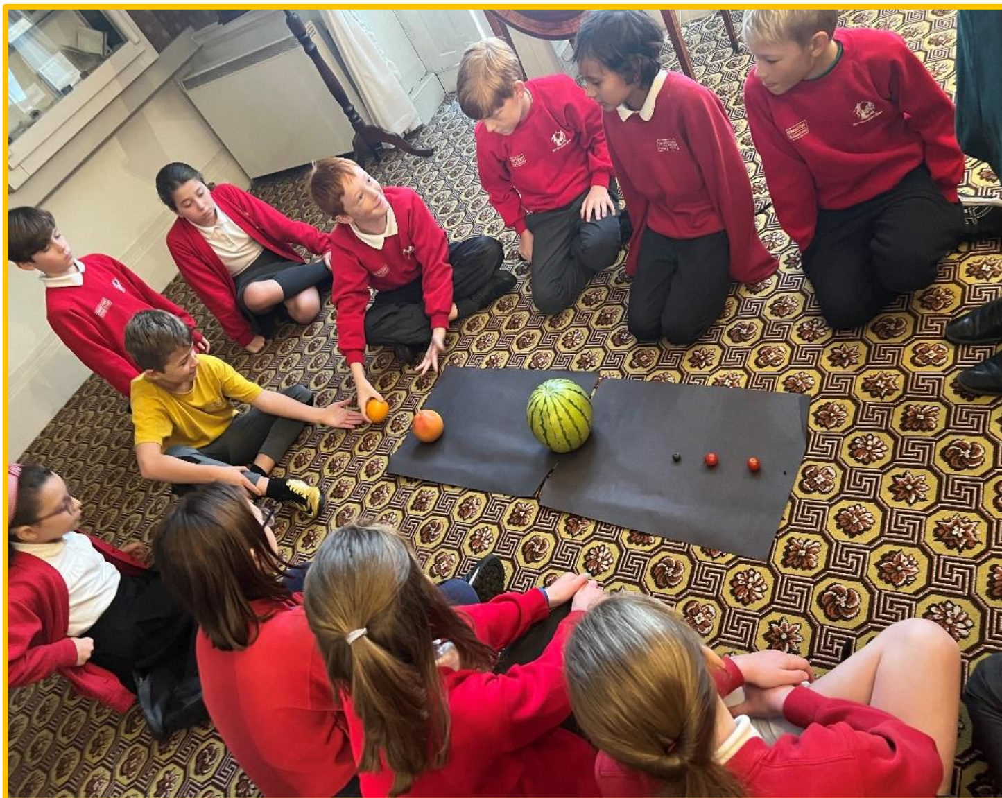
Class 5G represented the solar sytem with fruit.