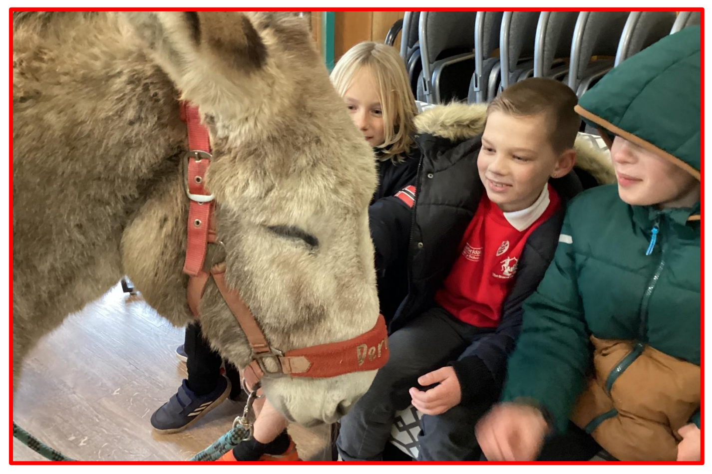
Learning and Communication Creativity and Imagination Personal Development Collaboration Citizenship