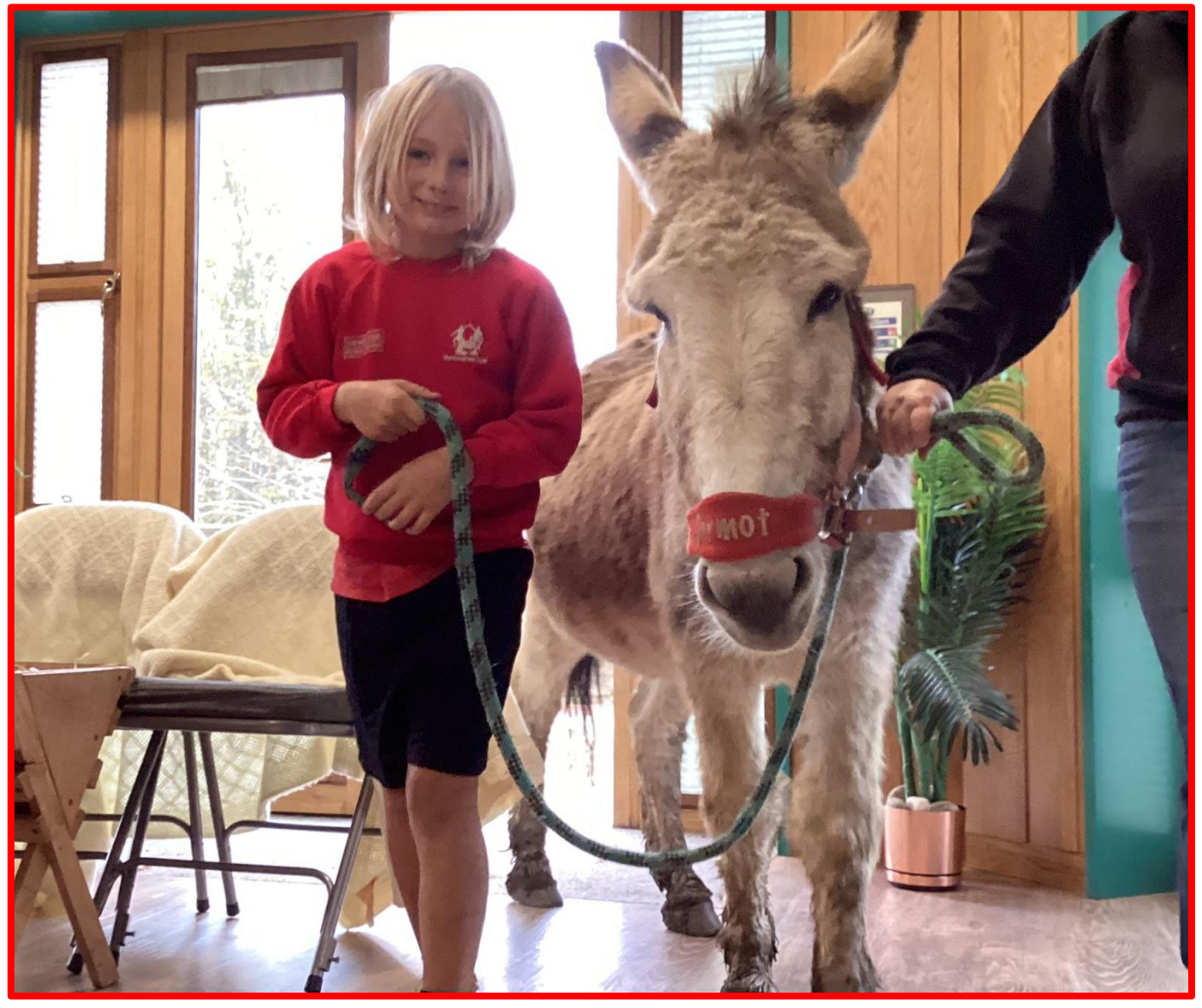
Learning and Communication Creativity and Imagination Personal Development Collaboration Citizenship