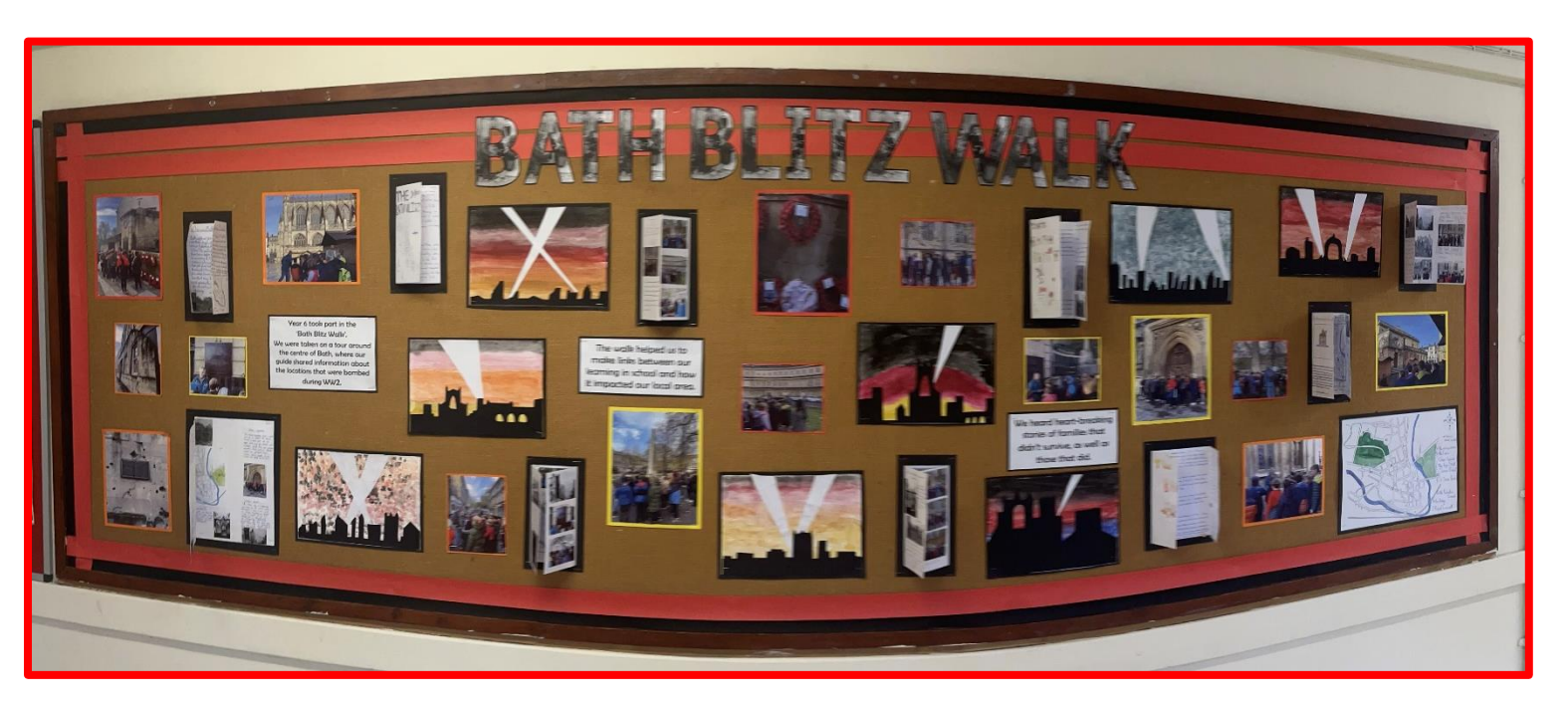
A Year 6 displayed, inspired by their recent Bath Blitz Walk