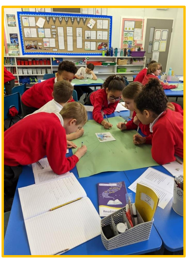
Class 4B – Practising Maths skills in ICT and writing character descriptions