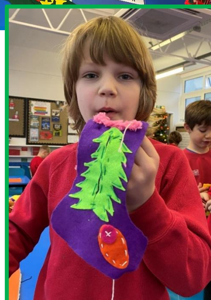
Year 4 sewing Christmas stockings and making Christingles.