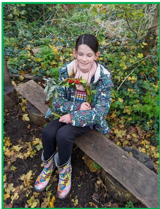
Year 4 Science, making Christmas wreaths and keeping warm by the fire.