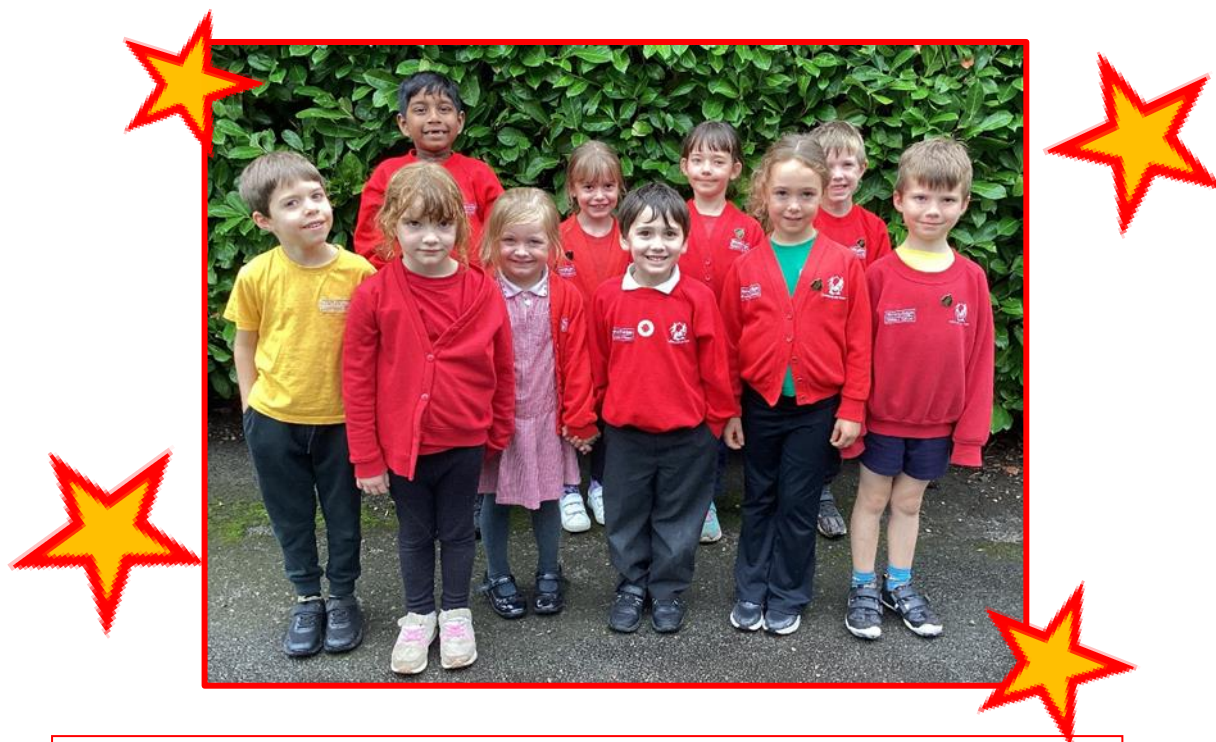
These are our Lower School Class Ambassadors