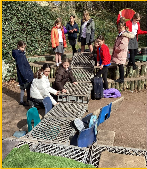
The children built 'Riverside Theme Park! Over the course of the week, they collaborated to build a slide, evaluating and making adjustments. There was also, importantly, a Reception selling tickets. The fun and laughter was infectious!