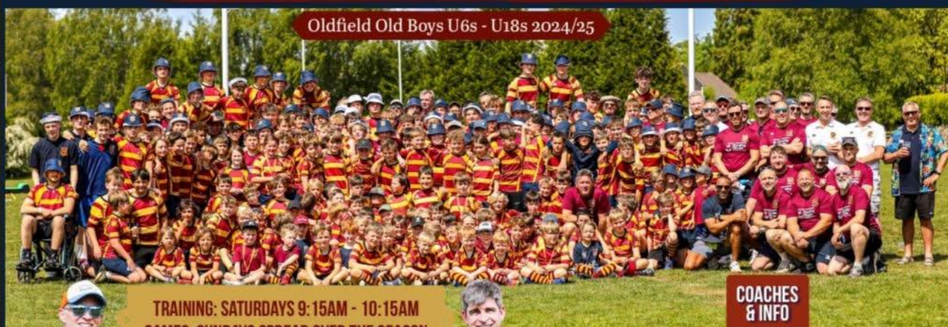
Oldfield Old Boys U6s - U18s 2024/25

TRAINING: SATURDAYS 9:15AM - 10:15AM GAMES: SUNDAYS SPREAD OVER THE SEASON