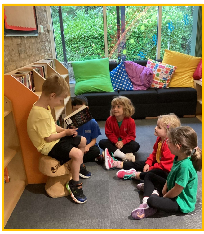
Learning and Communication Creativity and Imagination Personal Development Collaboration Citizenship