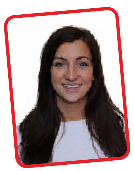
Miss Gatton 5G