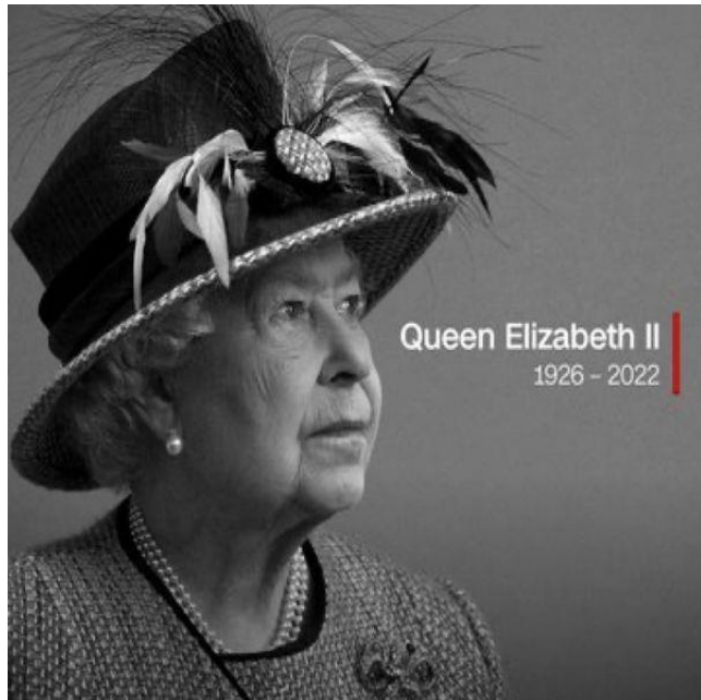
Queen Elizabeth II 1926 - 2022

Northbrook Primary Academy joins the nation in expressing our deepest sympathy on the passing of our Queen. We celebrate a lifetime of service, duty, dignity & stability, which is an example to us all. A light in troubled times for generations that we hope to emulate.