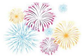
Dawson Cornthwaite, Y3

The fire burns big and bright, Whilst fireworks fill the sky with light. Going home ready for bed, Mummy says let's have hot chocolate instead!