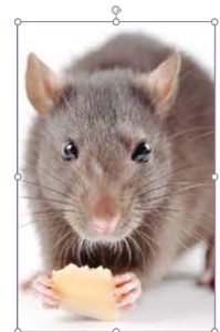
Paighton Wignall, Y6

Rats live in darkness away from the sun, Deep underground where the sewage runs. They're very dirty and also smelly, With little legs and a round hung belly. They eat anything that they can find, Insects, animals, garbage – they don't mind! They spread diseases and also the plague, But not in water, they don't bathe. I wouldn't like one for a pet, It would eat my dinner, I expect. They're better off underground where all the other rats are found.