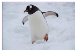
Darcie Blair, Y4

Rats live in darkness away from the sun, Deep underground where the sewage runs. They're very dirty and also smelly, With little legs and a round hung belly. They eat anything that they can find, Insects, animals, garbage – they don't mind! They spread diseases and also the plague, But not in water, they don't bathe. I wouldn't like one for a pet, It would eat my dinner, I expect. They're better off underground where all the other rats are found.