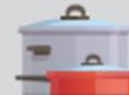
Pots & Pans