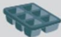
Ice Cube Trays