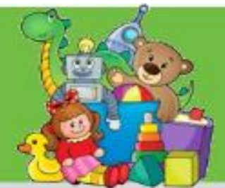
Small World Toys