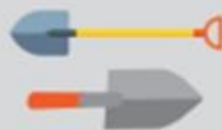
Shovels & Spades