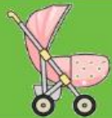
Buggies and Prams