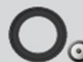
Tires & Wheels