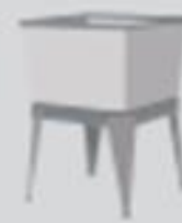
Sinks & Tubs