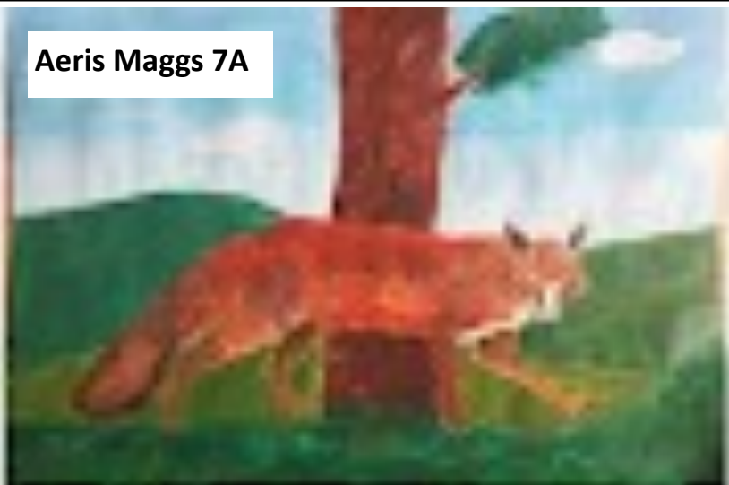
Aeris Maggs 7A