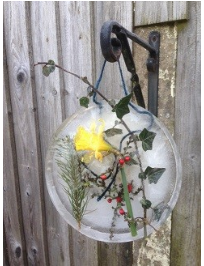
This fabulous ice sculpture was created by Archie Sandy from 5S.