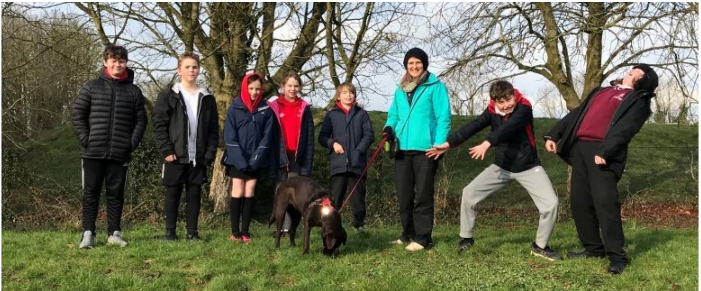
Always make time for some fresh air and a break from your screens.