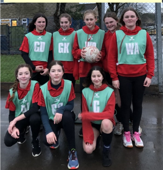
Netball Tournament at Fairlands, Cheddar