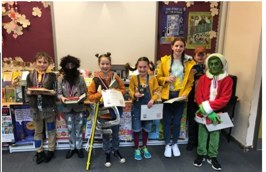
KS2 WBD Costume Winners

Against the odds of travel sickness, wet weather, high winds and having to get straight into the tournament on arrival, our girls played amazingly well. They remembered everything they'd been taught, they adapted their tactics and their ambition to win shone through. The final scores were: