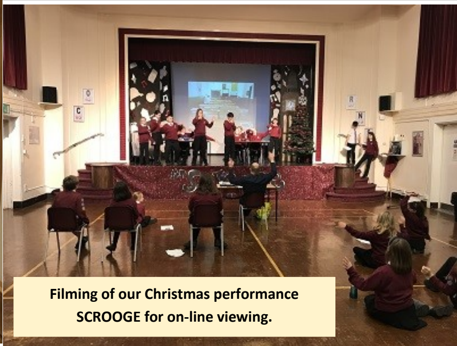
Filming of our Christmas performance SCROOGE for on-line viewing.