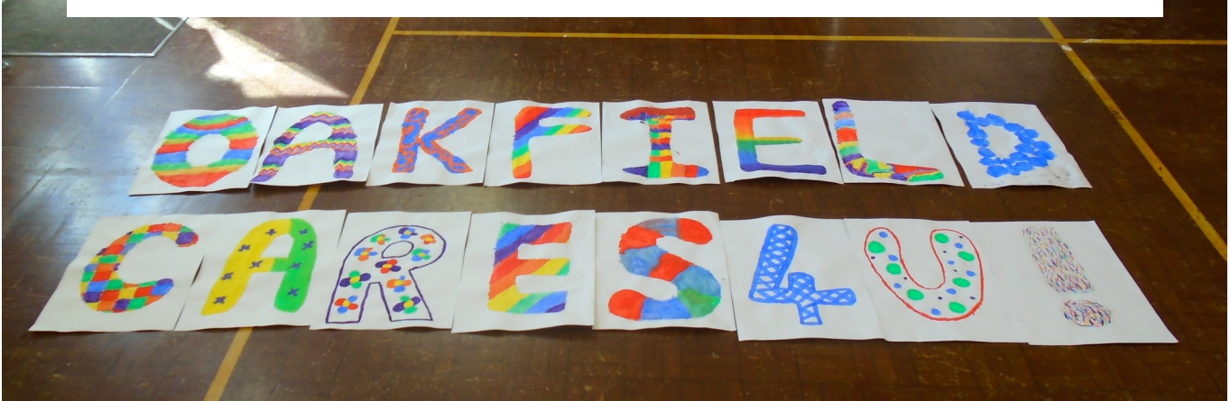
Pupils' caring message which is now displayed in the windows at the front of the academy.