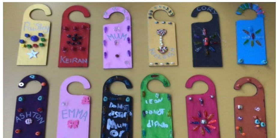
Fabulous door hangers created by our Flexible Learning Group