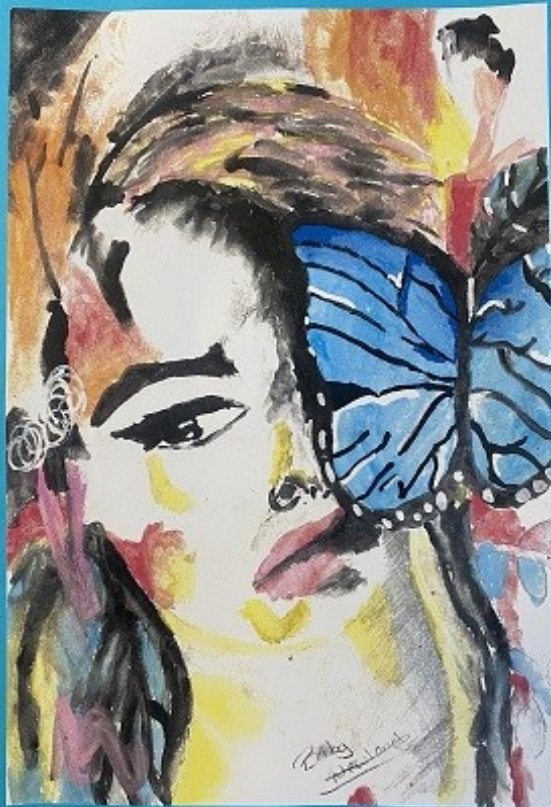
Bobby Newland, 7N