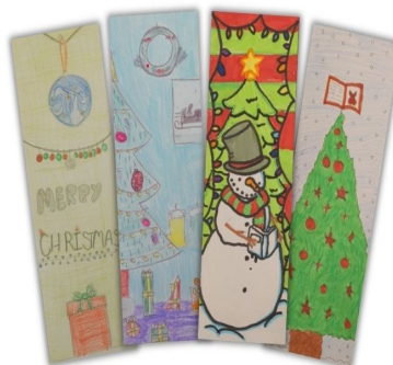
The winning designs