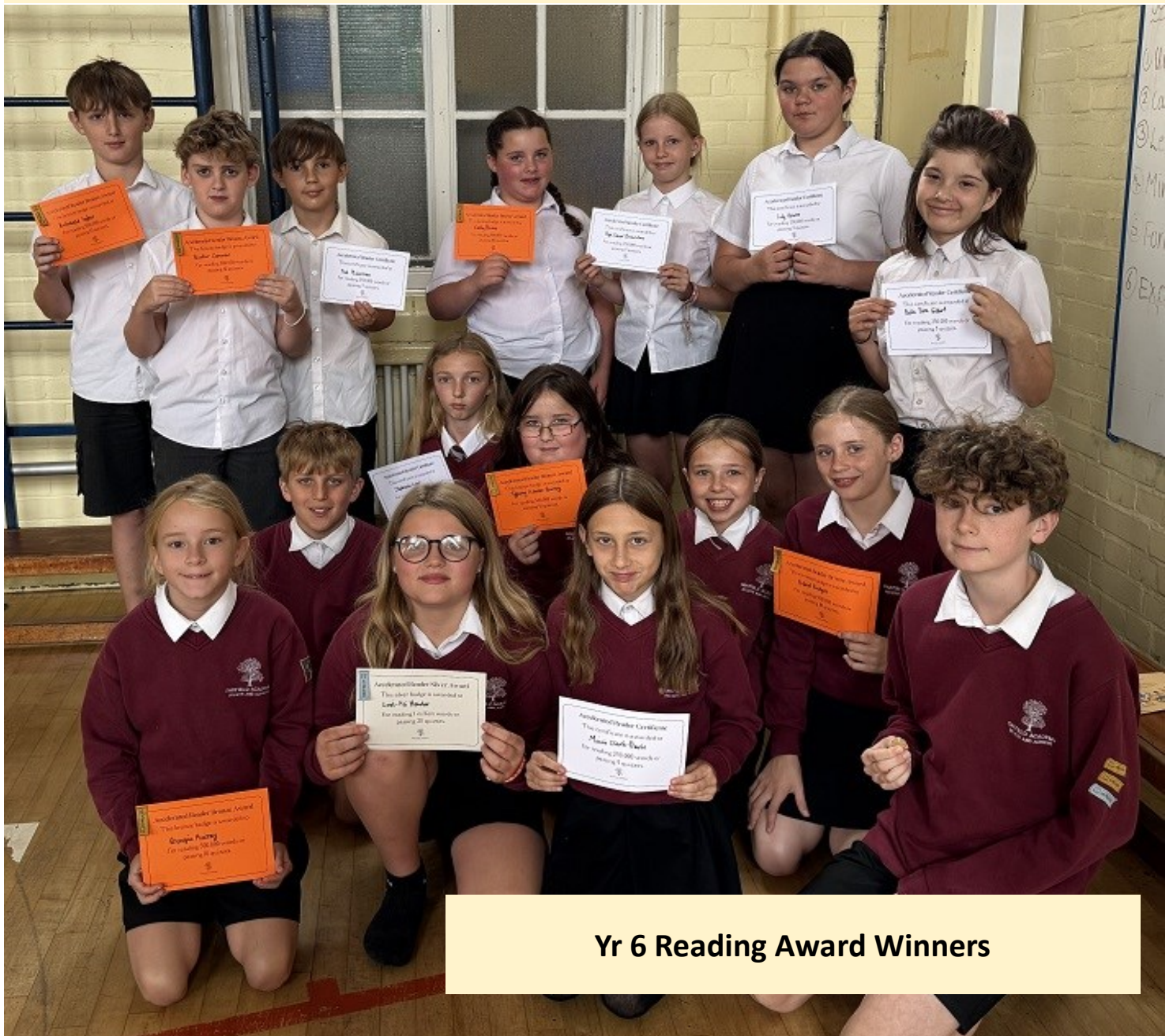
Yr 6 Reading Award Winners