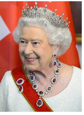
It's nearly our double celebration day—next Friday, 27th May!