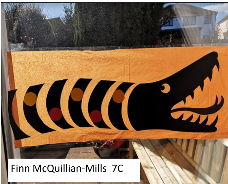
Finn McQuillan-Mills 7C