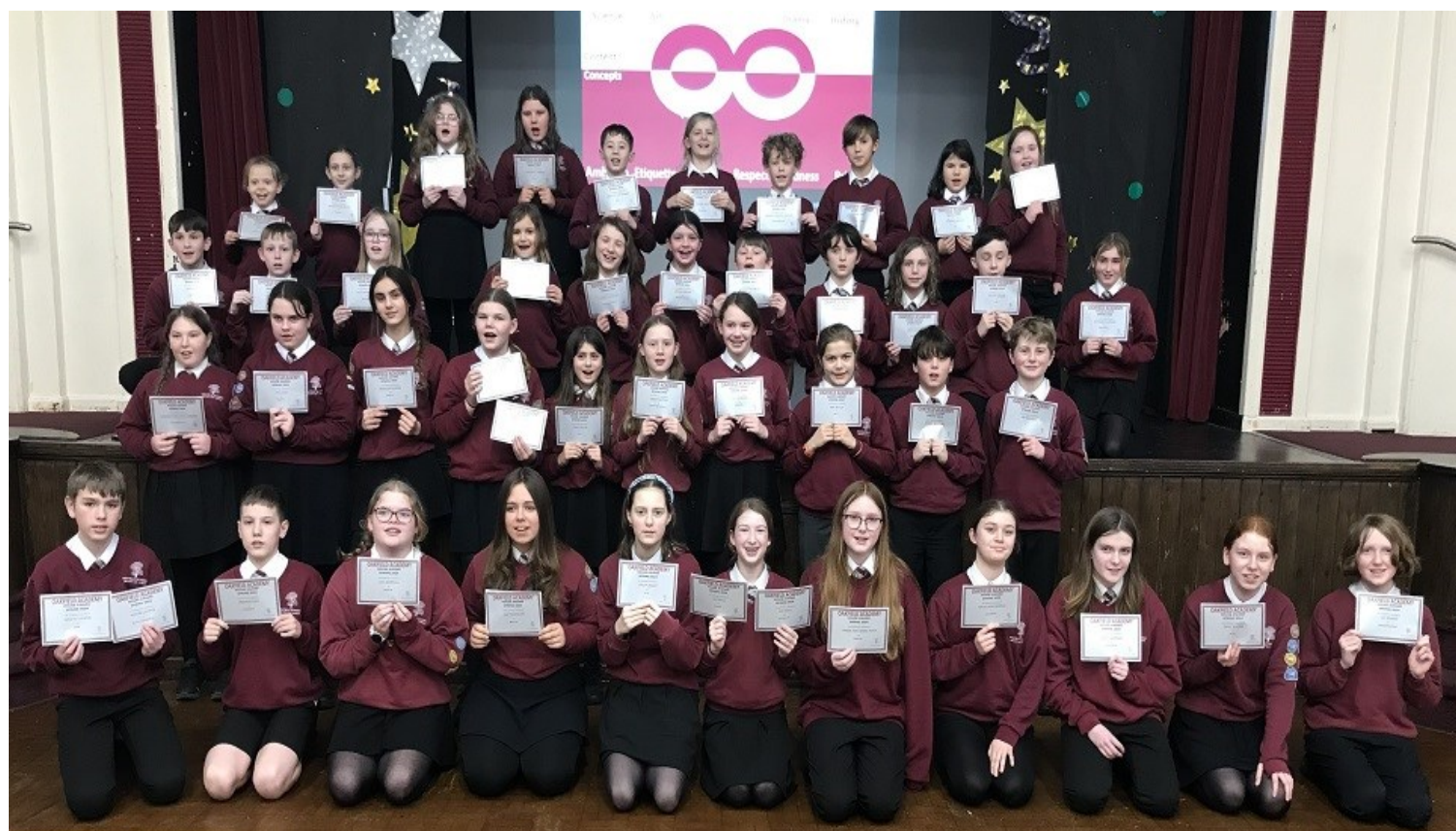
Reward Assembly for Aspiring House —Thursday 8th February 2024