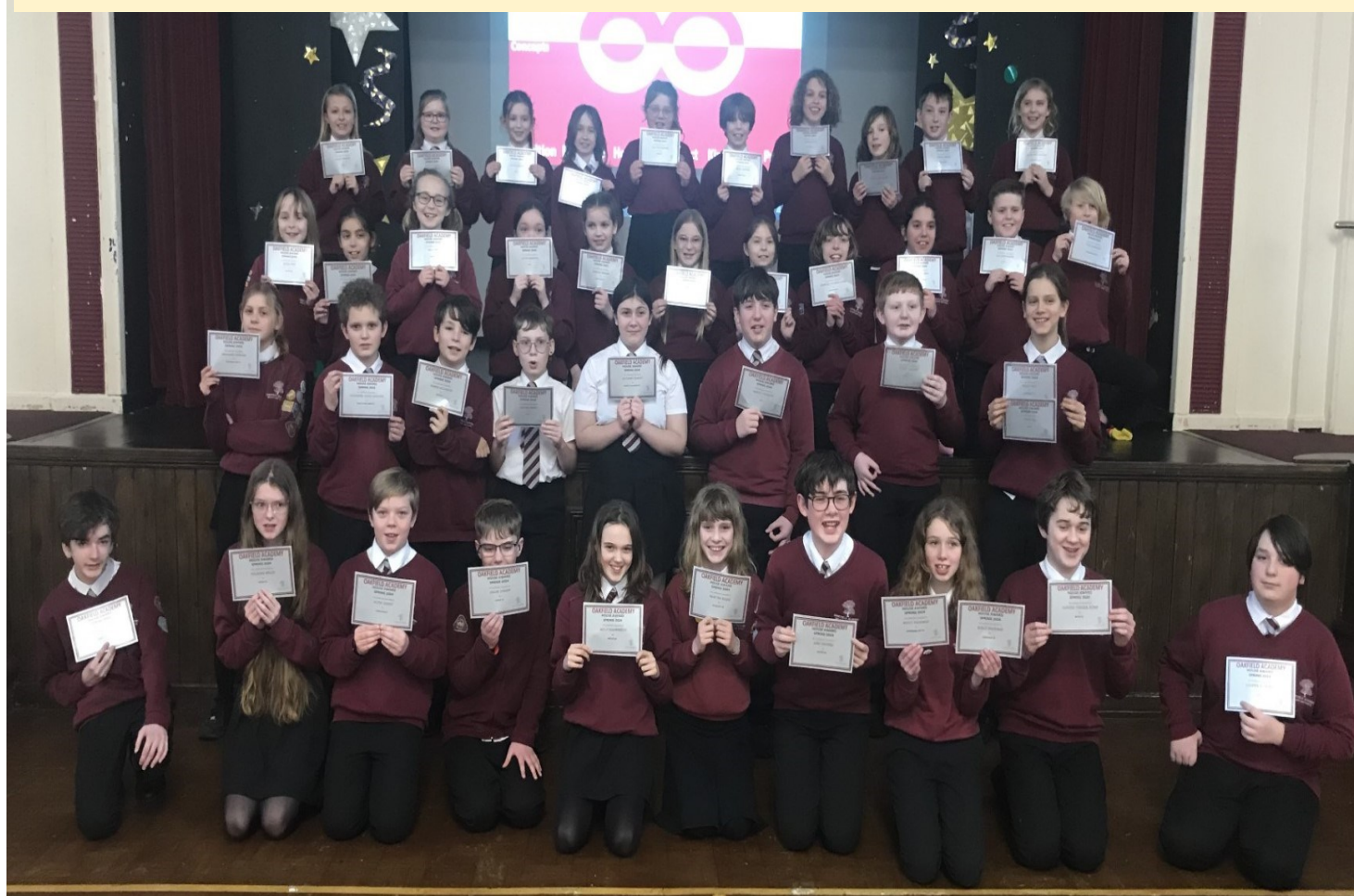
Successful House Reward Assembly— Monday 5th February 2024