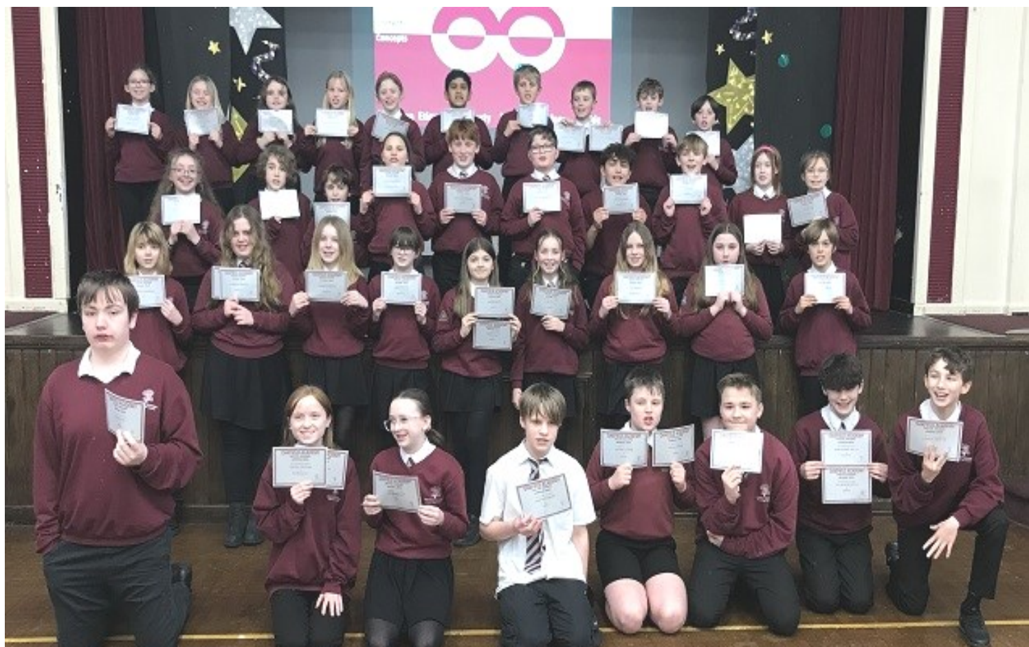
Reward Assembly for Outstanding House —Wednesday 7th February 2024