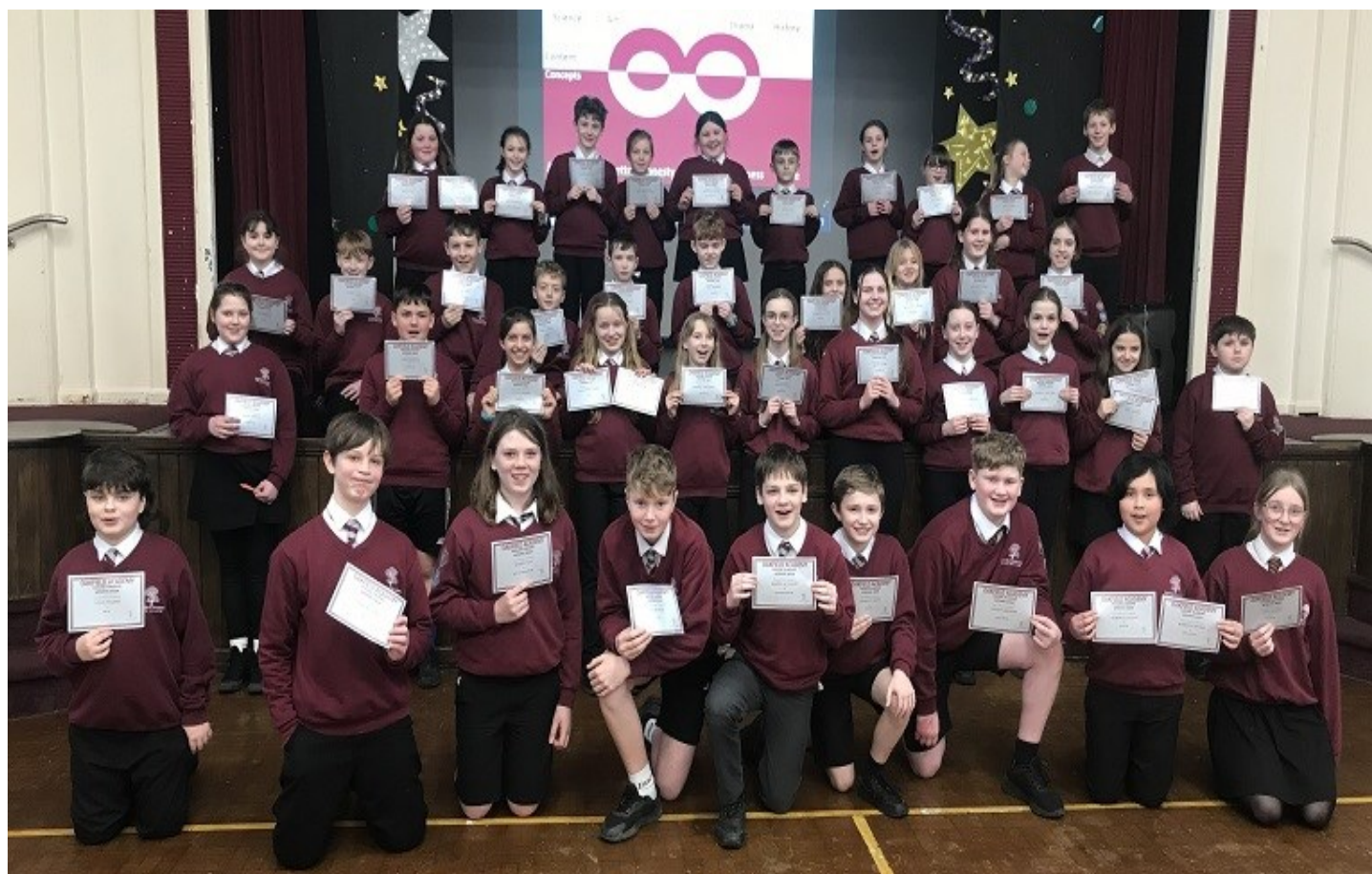
Noble House Reward Assembly - Tuesday 6th February 2024