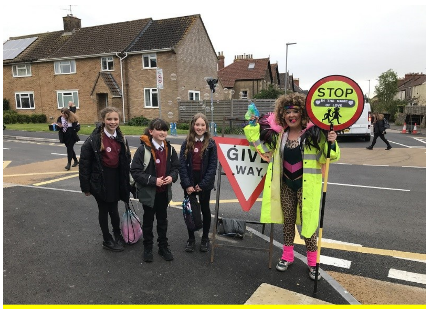
'Mojo Moves' supporting the start of the Safer Streets Campaign on Monday morning.