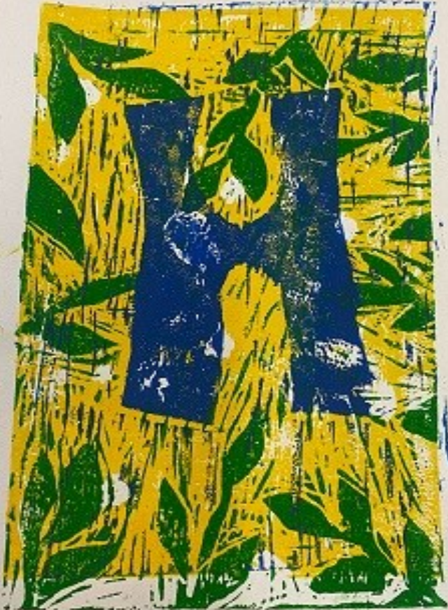
Holly / 8S / 2024