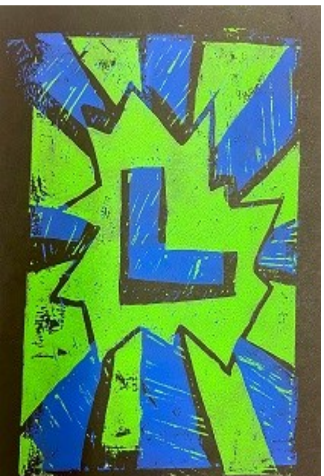
Luca 8R / 2024