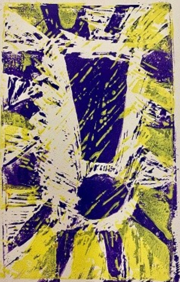
Martha / 8C / 2024