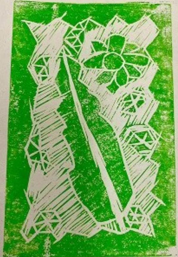
Herbie / 8S / 2024