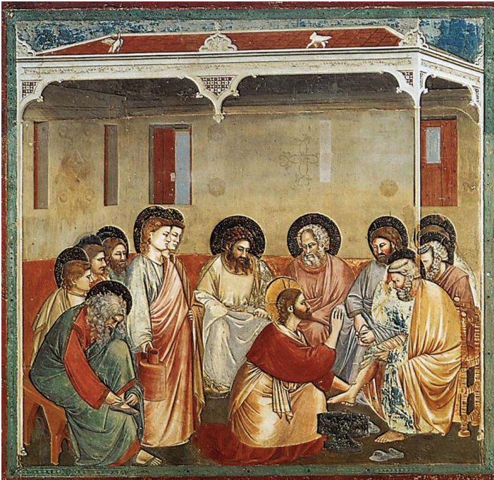
Washing of the Feet, Giotto, Scrovegni Chapel

O God, who in creating the human race willed that man and wife should be one, join, we pray, in a bond of inseparable love these your servants who are to be united in the covenant of Marriage, so that, as you make their love fruitful, they may become, by your grace, witnesses to charity itself.