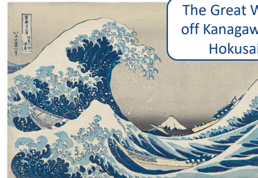
The Great Wave off Kanagawa by Hokusai