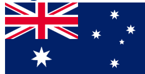
Flag of Australia: