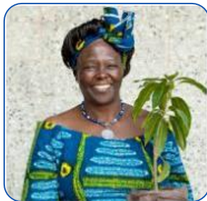
Wangari Maathai (1940 – 2011)

A Kenyan environmentalist who was the founder of the Green Belt Movement.