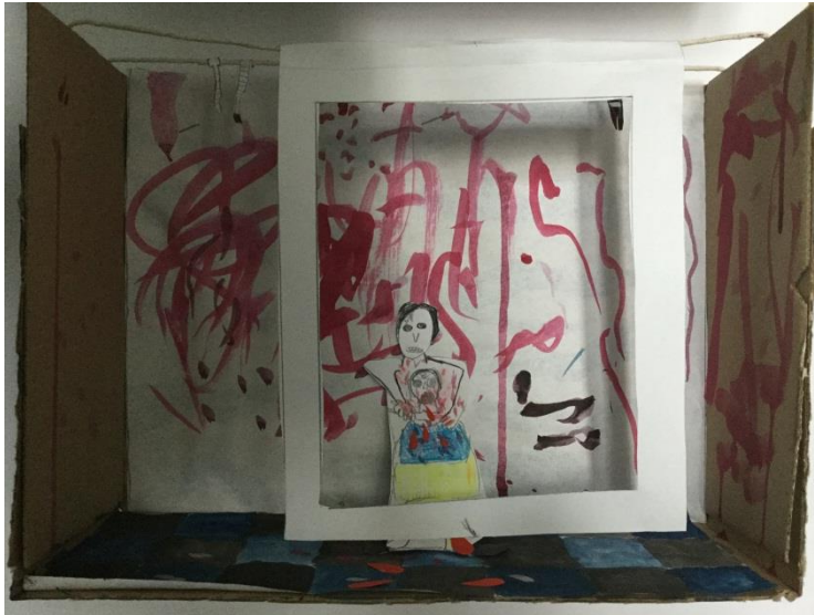
The dentists's surgery

Year 6 have had a busy start to their final half term at Oxford Gardens. As well as working hard towards their final writing assessments, rehearsals for the production, 'A Little Shop of Horrors' are well under way. Last week, we made our own set design models of how we envisage the set to look. You can see some of the designs below.