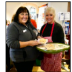
Fresh Turkey Barms from 12:30 - 2:00pm (or until we run out) Also Veggie Burgers available