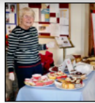
Choice of Cakes