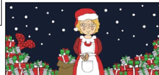
Visit Mother Christmas Here at St Mary's