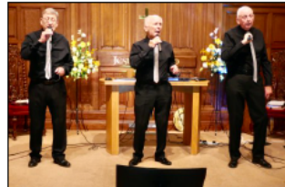
Our own Boy Band