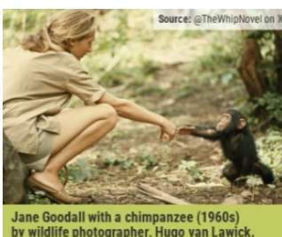
Jane Goodall with a chimpanzee (1960s)