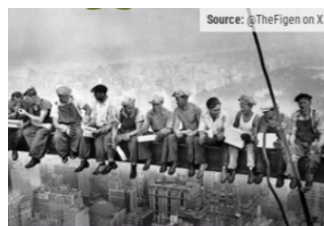
Lunch atop a Skyscraper (1932) by photographer, Charles C. Ebbets.