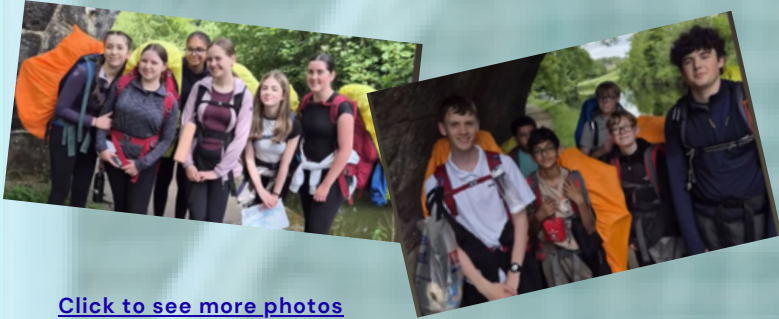
Click to see more photos

Rounders and cricket season are well underway please keep a look out at google classroom and emails regarding upcoming matches